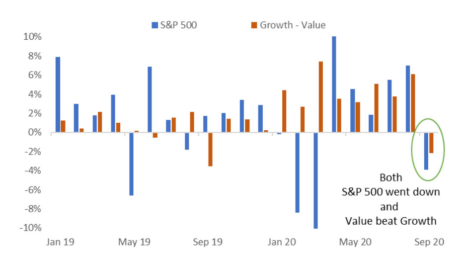
Exhibit 3. S&P 500 and Growth - Value Return Differential

Value stocks outperformed Growth in the S&P 500 last month. This is unusual for two reasons. Firstly, since January 2019 there have been only three months where this has happened and secondly, Value outperformed even as the market declined.