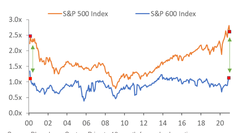
Exhibit 3. The S&P 600 trades at a historical discount to the S&P 500

Price to 12-month-forward sales ratio.